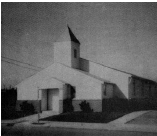
First Missionary Baptist Church, Salinas, Calif., recently celebrated its 40th anniversary.